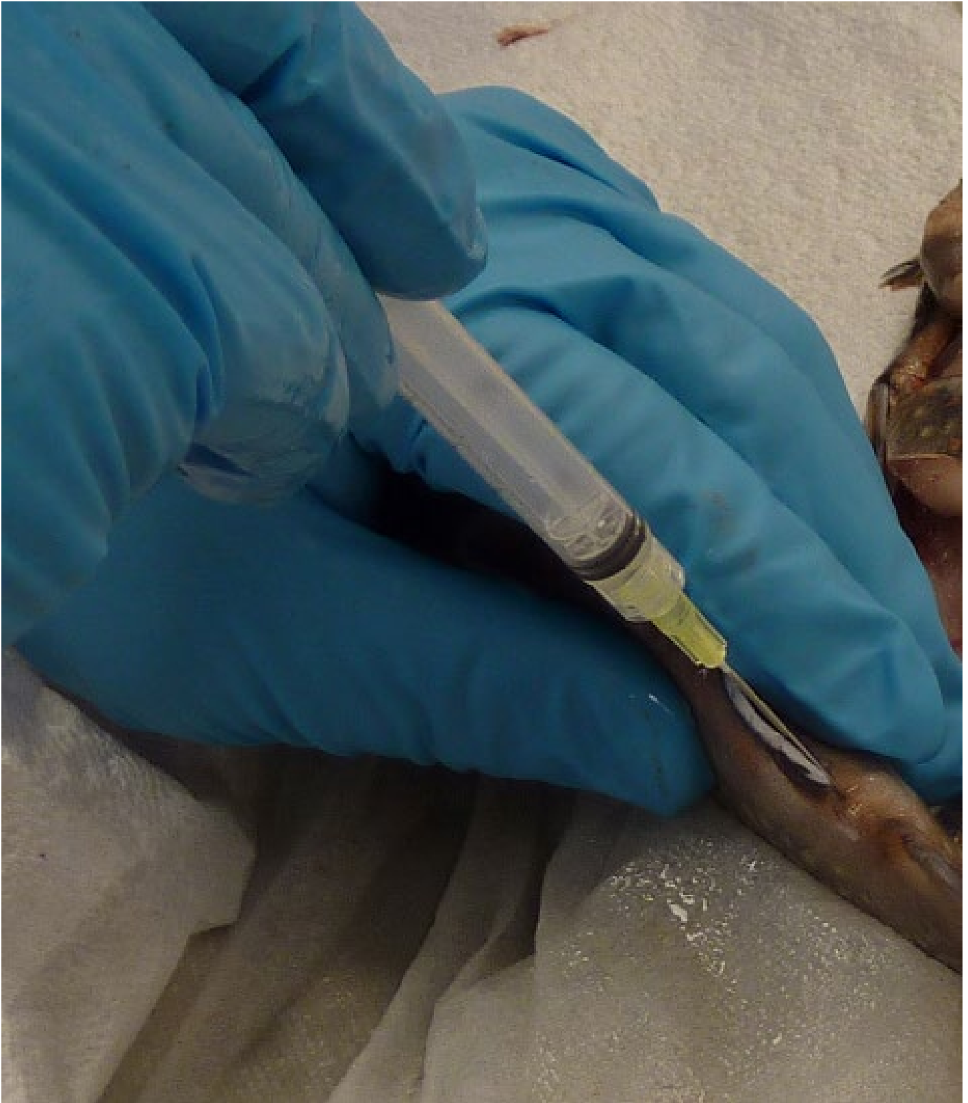
Photo 1. Caudal Blood Sample